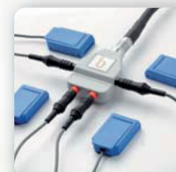
RF 3D Box with adhesive electrodes for automatic RF therapy