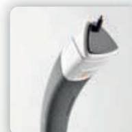
RF T-POINT (wrinkles, face, stretch marks)