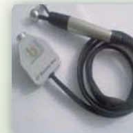
RF SPHERES (Bipolar)